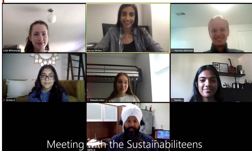
Meeting with the Sustainabiliteens