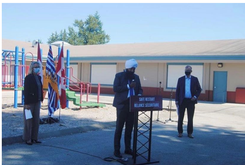
Announcing the Safe Return to Class Fund with Minister of Digital Government, the Honourable Joyce Murray, at Forsyth Elementary School. This $242 million of federal funding will support the province with safely reopening schools in BC.

We will continue to help Canadians put food on the table, keep businesses open, create jobs, support women in the economy, and ensure our fiscal sustainability.